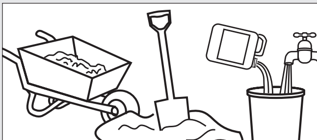
As an admixture